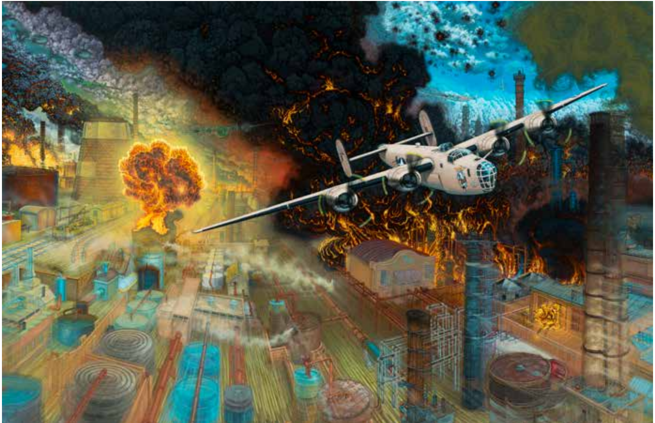
Odessos, Raid on Ploesti , 1996, acrylic on canvas, 30" x 46"

and the commonality that, at the end of the day, the creatures would lay down to rest, just as we do. "Most people don't realize children's books can be more contemplative in moral applications than adult books at times."