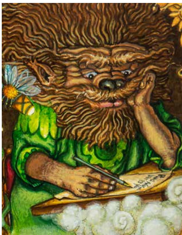
The artist's depiction of Odessos.

"I can recall getting scolded for drawing on walls and furniture before being handed some paper, so I would assume my artistic compulsion was naturally embedded."