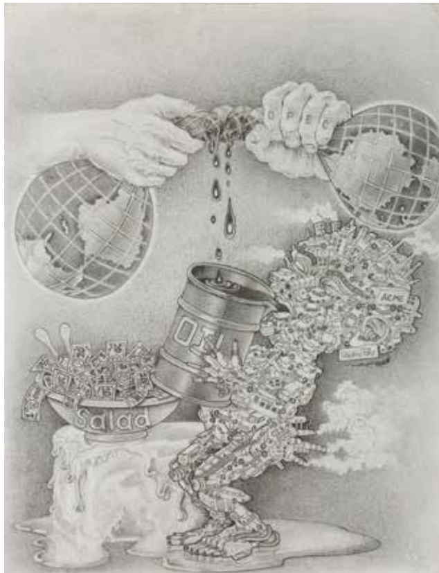
Odessos, To the Last Drop , 2009, pencil on paper, 8" x 11"