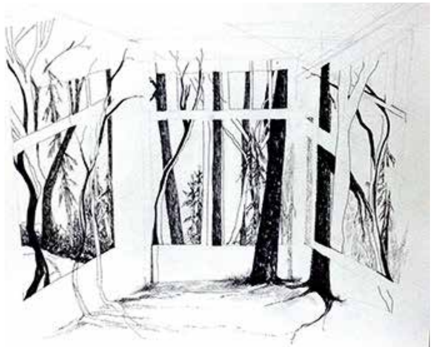
Lynn Guttman, Bedroom Window , 2015, black ink

for me this fleeting pleasure is some times enough.