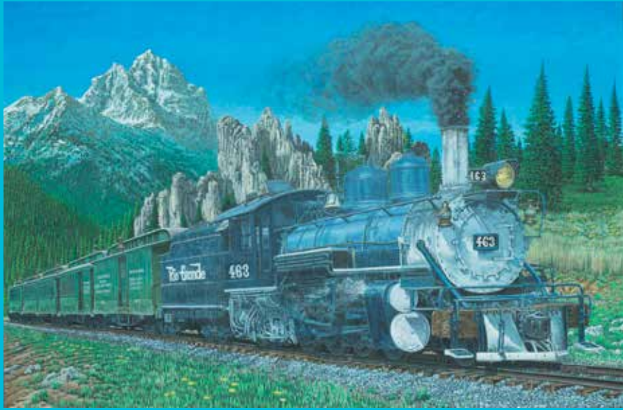
Odessos, Engine #463 , 1985, acrylic on canvas, 24" x 16"