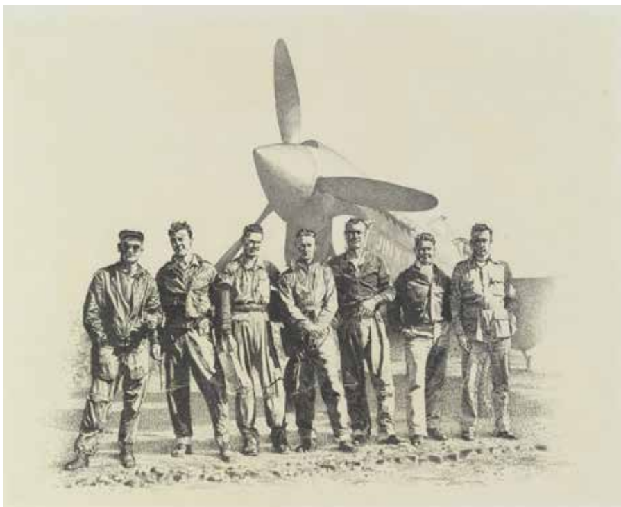
Odessos, Assaim Dragon Squadron , 1980, pencil on illustration board, 15" x 20"