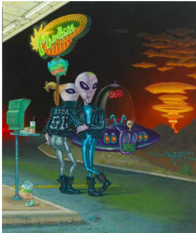
Odessos, Area 51's , 2014, acrylic on Bristol board, 17" x 15"