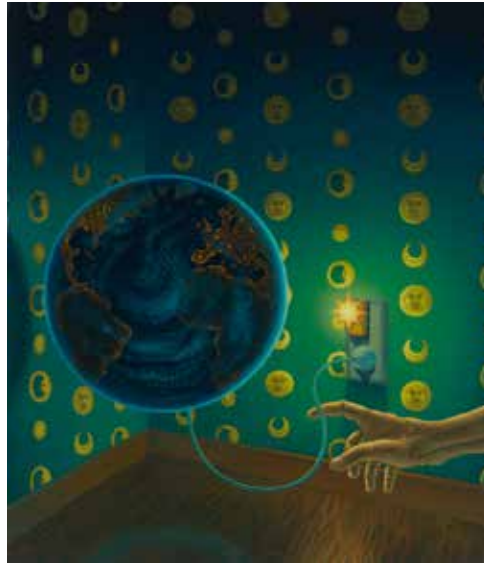
Odessos, Nightlight , 2002, acrylics on canvas, 28" x 32"