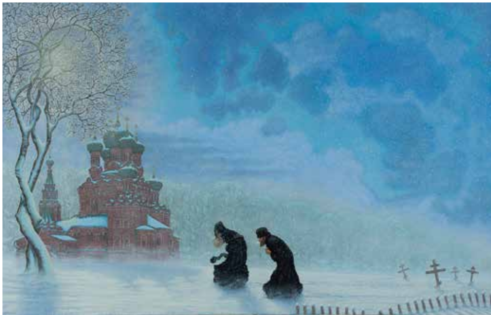
Odessos, Moscow 1812 , 2004, acrylic on canvas, 32" x 50"