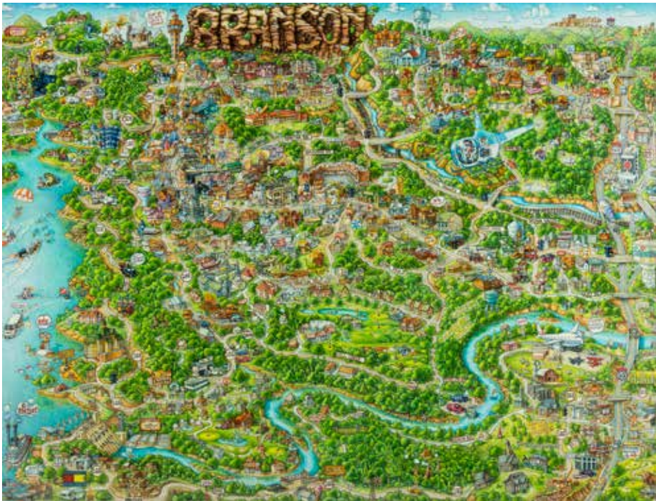
Odessos, Branson Town , 2018, ink/colored pencil on Bristol board, 30" x 33"