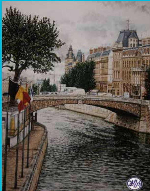
Odessos, Petit Pont , 1996, acrylic on canvas, 9" x 11.5"

Partial funding for the publication of Kaleidoscope provided by: Lloyd L. and Louise K. Smith Foundation Kenneth L. Calhoun Charitable Trust